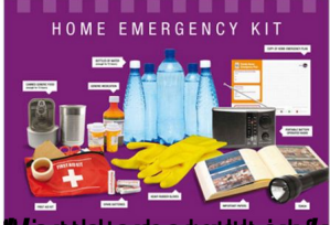
Minimize the risk of injury by having a home emergency kit