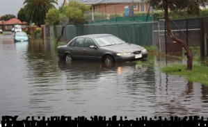
Be aware of the danger of flooding