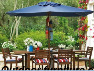
Outdoor furniture can start like this...