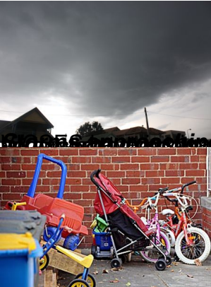
Bikes and bins and other loose things can become airborne in high winds

Friday, 03 February 2012 09:40 - Last Updated Thursday, 22 March 2018 07:57