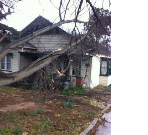
Be aware that the wind can fall with great force and significant damage can be done to the structure of the house.