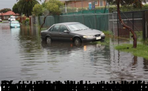
Be aware that floodwaters can rise quickly and become very dangerous.